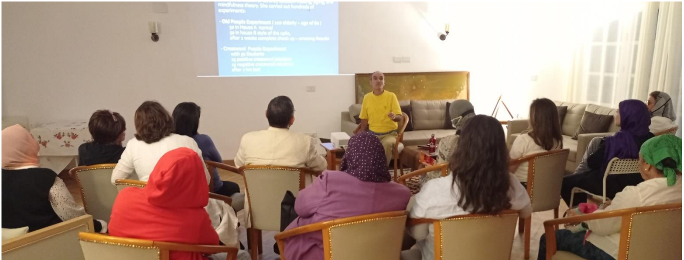
Golo presenting "Peace and Hope in Difficult Times"

"Hope is not the conviction that something will turn out well, but the certainty that something makes sense, regardless of how it turns out." — Vaclav Havel